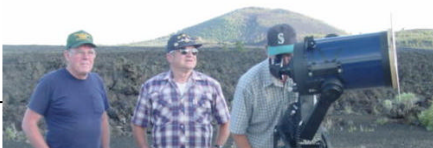
Viewers at a previous Craters event

of June is the month of the first Craters of the Moon Star Party. It will be held Friday night June 10 and Saturday night June 11. This is the same weekend as our scheduled June Meeting so we will probably have it at Craters. This is always a fun event at a very picturesque site.